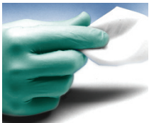
Swab tests validate successful cleaning with ALCONOX-brand detergents.